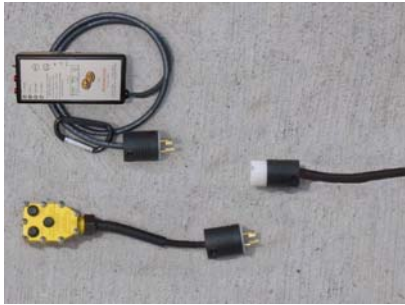
Connectors attached to Autopuller, original pull head and cord.

The Autopuller was designed to be used with either your existing pull cord or an external grade extension cord. If you use the existing cord, remove the head from the cord and install a female connector in its place. A mating male connector is installed on the original head and on the Autopuller. This will allow you the choice of either control unit. If you decide to replace the pull cord with an exterior grade extension cord, install the necessary connectors on the cord and on the Autopuller. See installation for wiring instructions.